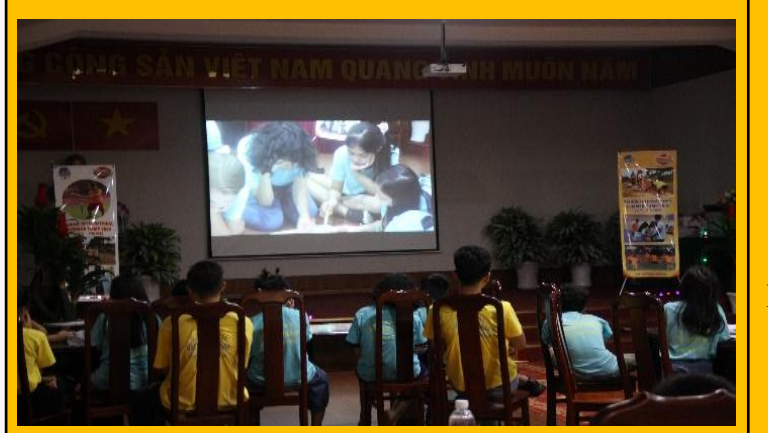
18h30-19h00 Summary Video Clip