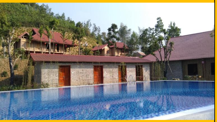
17h00-17h45 Sports: Swimming