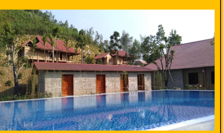
17h00-17h45 Sports: Swimming