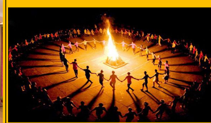
CAMPFIRE: World Dance-Global Citizen