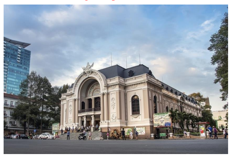
Saigon Opera House